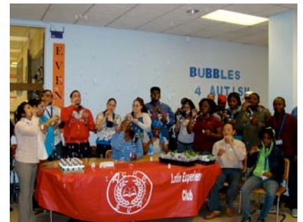
Students and staff blow Bubbles 4 Autism April 26 at WACC.

The Latin Experience Club sponsored Bubbles 4 Autism April 26, part of a nationwide effort to help Faces 4 Autism set the Guinness World Record for blowing bubbles. The record is 37,000 people. Official notification is expected in June. Stay tuned!