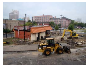
Crews are demolishing the former Fishheads Restaurant.

While we're expanding, be mindful that the portion of Baltic Avenue used for parking is closed until further notice, temporarily reducing the overall number of parking spaces available. Students, faculty and staff will still enter and exit the lots as normal.