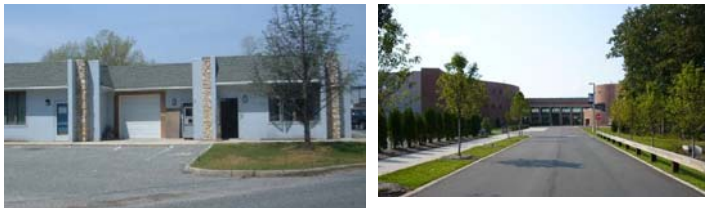
Above left, the former Cape May County Extension Center in Rio Grande. Above right, the Cape May County Campus today.