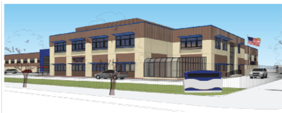
Artist's rendering of the WACC hospitality wing expansion.

Government and hospitality industry officials will join college representatives for a ceremonial groundbreaking at 2 p.m., Wednesday, May 9, for the Worthington Atlantic City Campus expansion.