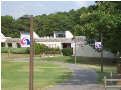
New banners grace the quad at the Mays Landing Campus.

http://www.atlantic.edu/about/relations and call College Relations at ext. 4907 if you have usage questions.