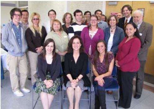
SKD inducted 16 new members April 24.