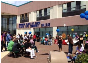
Students enjoy Earth Day festivities in the WACC courtyard.