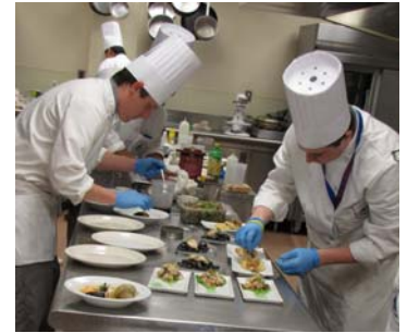
A team plates its creations for the judges during the Iron Student Chef competition.