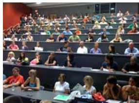
Nearly 150 students and quite a few parents attended New Student Day Aug. 17.

The floors are polished, bookstore shelves stocked, and white boards cleaned to perfection. Ah, the start of fall classes.